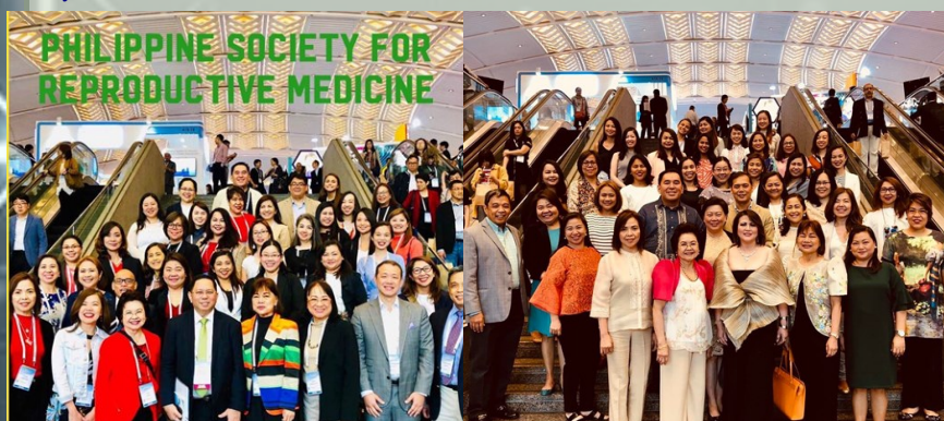
The Philippine contingent at the 9th Congress of the Asia Pacific Initiative on Reproduction. (Left) Members of the PSRM on the Day 1 of the Congress. (Right) PSRM members showing unity and pride in their eye-catching Filipiniana garments.

At its inception, the ASPIRE aimed to form a cohesive group of dedicated, pioneering experts who serve as advocates for infertility patients in the Asia-Pacific region. Each year has shown a marked growth in terms of scientific output, global participation, and number of attendees. It is clear from this year's congress that the society is well in the way of achieving its goals. Next year, we will witness this all from the front seat as we prepare for ASPIRE 2020 in Manila. It will truly be an exciting year ahead.