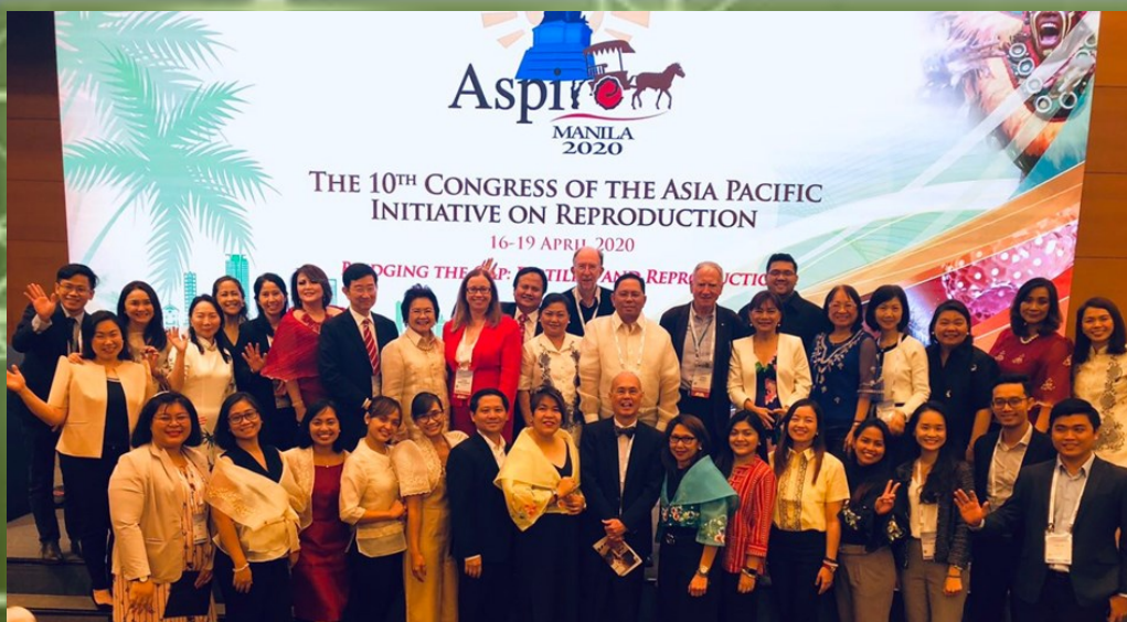
Jumpstarting ASPIRE 2020. Aspire leaders & administrators with the Filipino delegates taking a commemorative photo to joyfully herald in the 10th Congress.