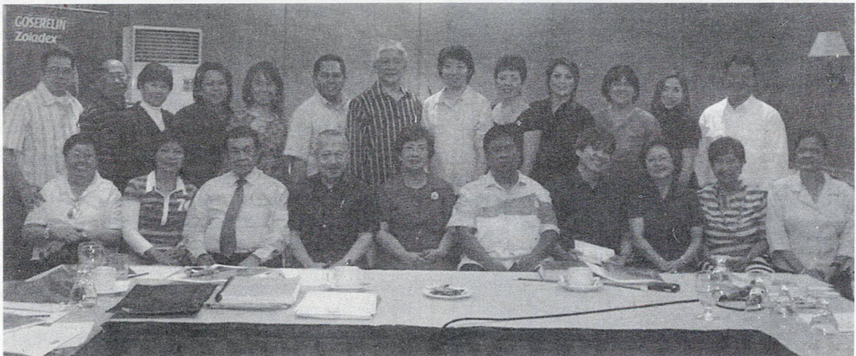
PARTICIPANTS: MAY 2006 ETHICS WORKSHOP