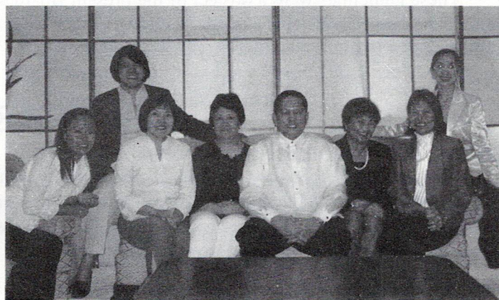
Outreach lecturers and some Cebu participants.