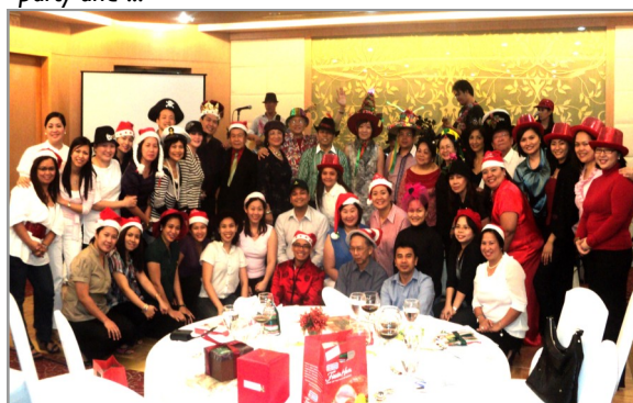
...PSREI Christmas party. Having a "Hat Theme", all members came in wearing unique and colourful headwear.