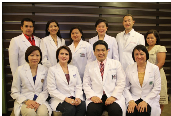
Members of the 2011 PSREI Annual Convention Organizing Committee with the members of the PSREI Board.