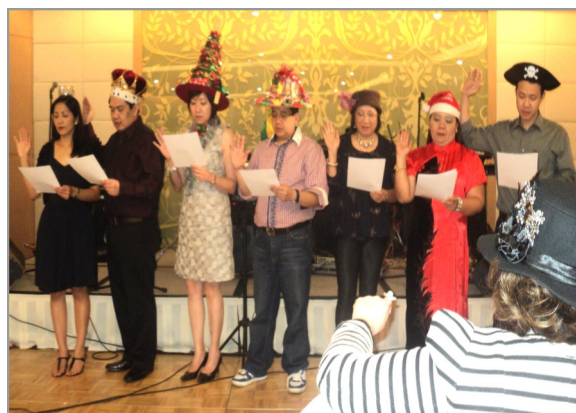
The 2011 PSREI Board of Directors take their Oath of Office during last December's year end appreciation party and ...