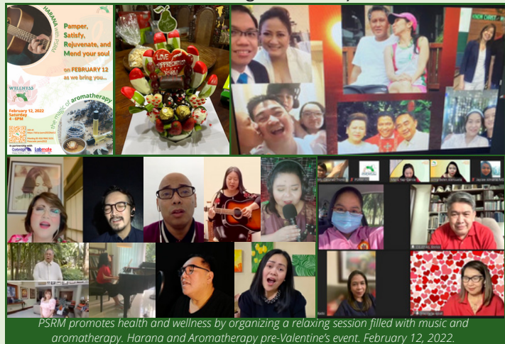
PSRM promotes health and wellness by organizing a relaxing session filled with music and aromatherapy. Harana and Aromatherapy pre-Valentine's event. February 12, 2022.

The Philippine Society for Reproductive Medicine is a society built on a strong foundation of excellence. This culture of excellence is passed down and shared among the fellows; all of whom work hard to ensure that the society is acknowledged as a leading voice in women's health. Recognizing the members' remarkable contributions, the society's leadership works equally hard to give back to its fellows. This is the spirit behind the efforts to promote wellness and camaraderie amongst the society's members.