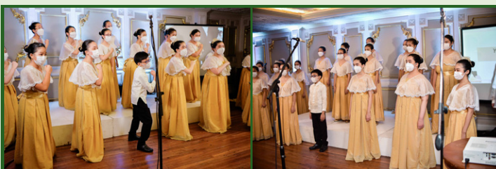
The world-class Young Voices of the Philippines performing Filipino songs for PSRM