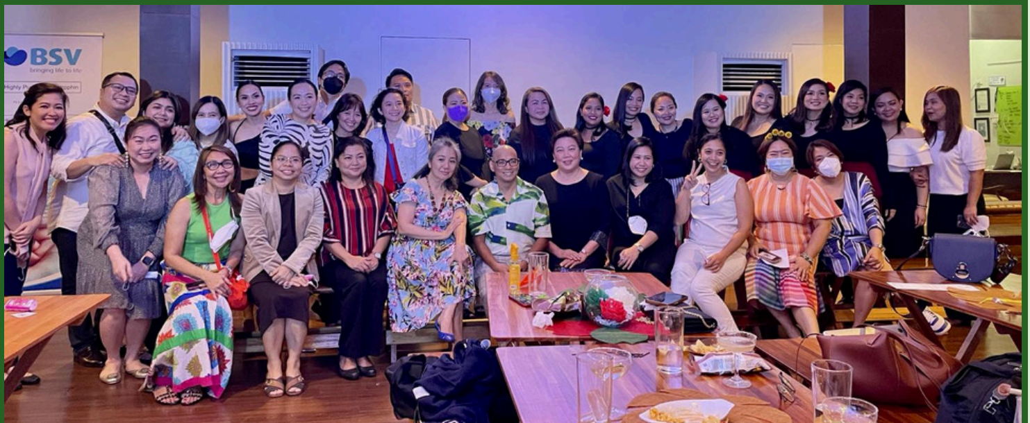
PSRM fellows together for the first face-to-face celebration in almost 3 years.