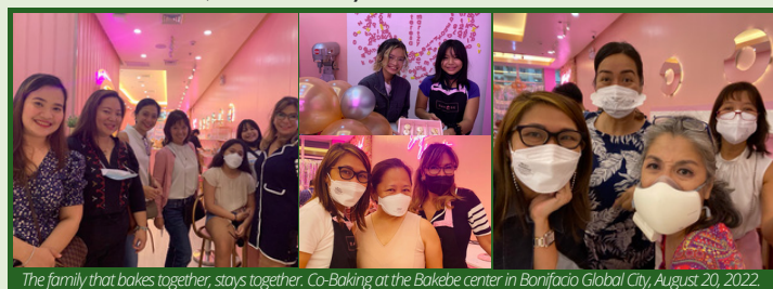
The family that bakes together, stays together. Co-Baking at the Bakebe center in Bonifacio Global City, August 20, 2022.

Last August 20, 2022, the Wellness sub-Committee cooked up another unique event at the Bakebe, co-baking space at the SM Aura. This family event proved to be the perfect recipe for camaraderie. Who knew that 3 hours of intense baking could turn fellows, friends, daughters, and sons into one big family? Peppered with laughter, mixed with cooperation, plus a tiny dash of competition, the entire event proved that PSRM could both have its cake and eat it, too - literally!